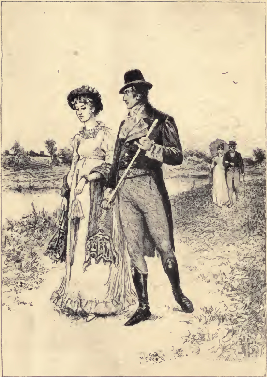
Bride and Prejudice They now walked on in silence, each of them in deep thought. Vol. II, P. 98.